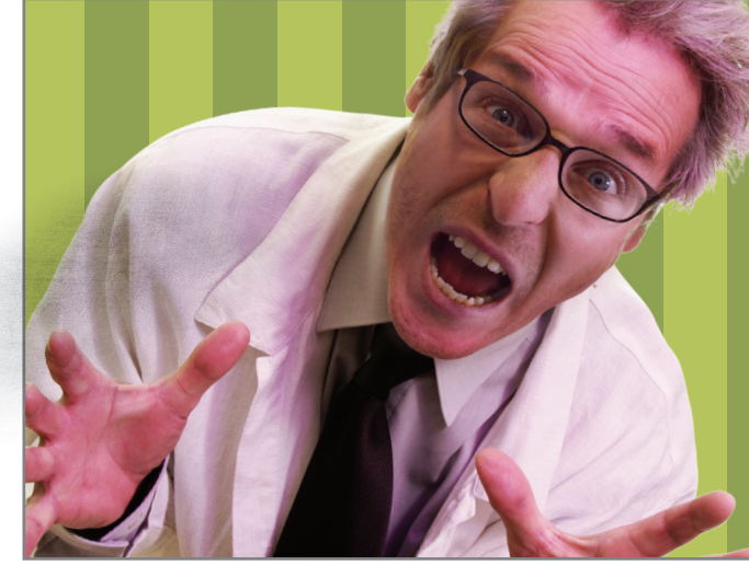
Professor Bounce: 'The truth is out there – and it's furry'

New York and that place in Iceland that no one can ever spell properly. When asked what actual evidence he had to support his startling theories, Professor Bounce told reporters, 'none at all.'