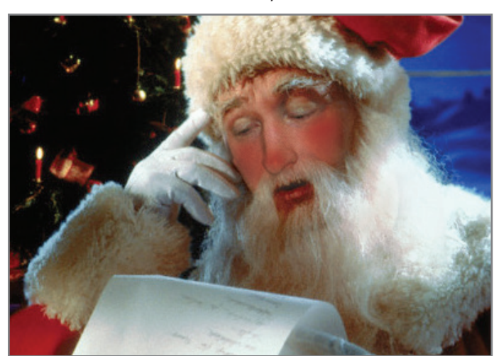
Well-known fun merchant: Father Christmas, yesterday

Christmas is a time for friends, family, eating so much you can hardly move, falling asleep in front of a really boring black and white film on TV and stuffing your face with sweets, even though you feel sick and don't really want them anymore. It certainly isn't a time to go threatening jolly old men with bashings and grapes.' As for Father Christmas himself, he issued a brief statement yesterday. 'I have received Mr Gum's letter,' he said, 'but I'm afraid I can't possibly comment on it. You see, I don't actually exist.'